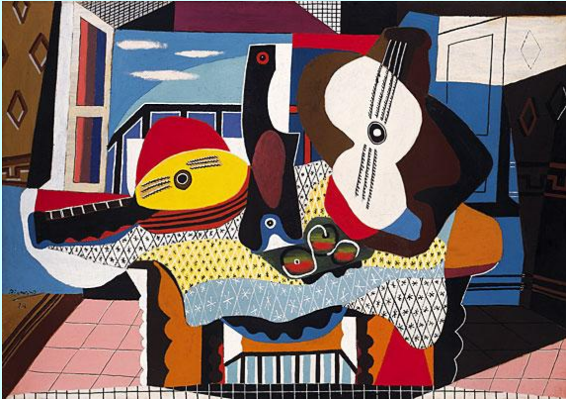
Pablo Picasso "Mandolin and Guitar"